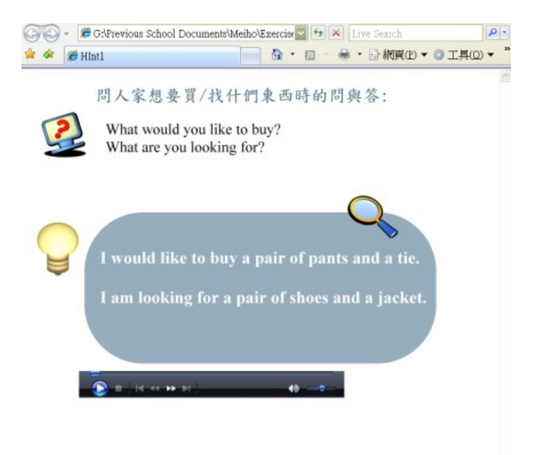
Figure 4-4: Test#9 Learning scaffolding 2 for Question 1