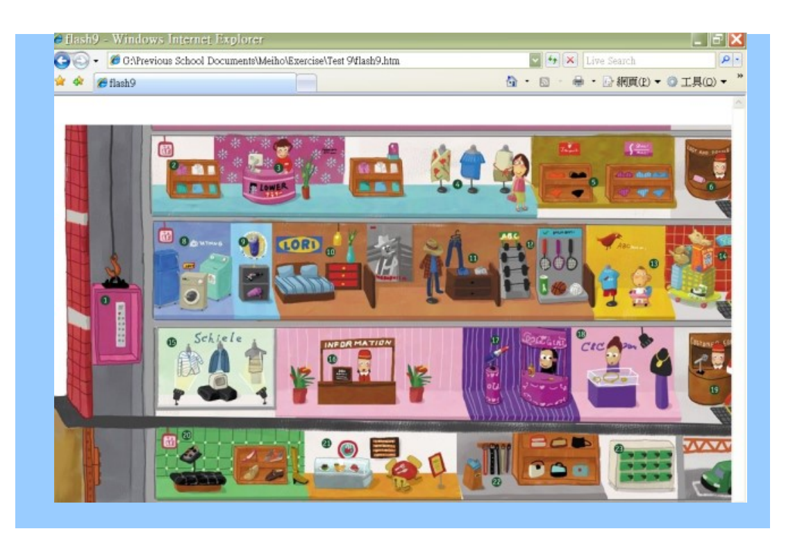
Figure 4-7: Learning scaffolding 1 for Question 7 (different departments)

Test#9 Question 7: Wrong answer selected. Learning scaffolding 1, was shown below: