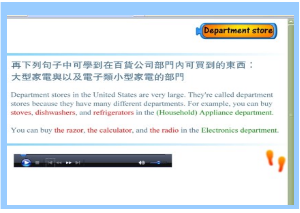
Figure 4-8: Learning scaffolding 2 for Question 7