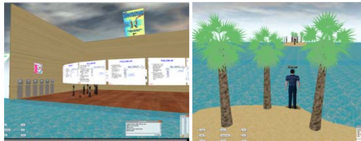
Figure 1. The low abstract virtual space, adopted an island metaphor.

location of other groups (see Figure 1). The classroom/meeting room acted as the central hub, where participants could teleport to and from their group islands by walking through a door on each island or one of the numbered doors in the classroom/meeting room.