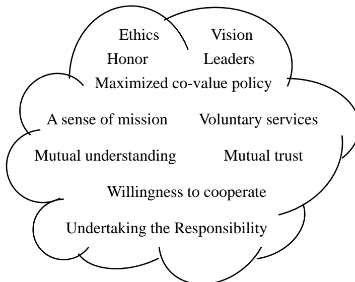
Figure 1. The Model of Leadership Cloud

Leadership and management are the most widely presented and studied topic in the organizational literature because they may decide effectiveness and growth or disruption of an organization (Johns, 1996). Leadership cloud, the foundation of cloud management, includes and relates the times and occasion, the environment and situation, the internal and external participants, the events, and established or extemporaneous policy. Leadership cloud is the region of leadership attributes and situations surrounding leaders and these elements are embedded in the virtual cloud. Figure 1 is the model of leadership cloud.